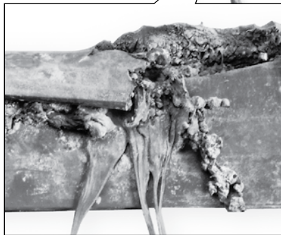
Urethane blade damage from friction and thermal changes