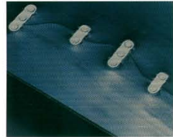
Flexco RP and Bolt Solid Plate Fasteners

To repair jagged rips or to bridge soft spots before they become rips, our three-bolt Rip Plates (RP1 and RP2) are the answer. These plates are extra long and should be installed crosswise to the belt. Two of the three bolts should be placed on the weak, or "flap," side of a jagged tear to increase stability. Alternating two- and three-bolt rip repair fasteners is recommended. Rip Repair Fasteners are installed with the same punches, wrenches and bolt breakers as FLEXCO Bolt Solid Plate Fasteners.