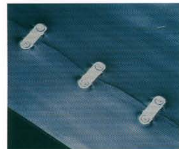
Flexco Bolt Solid Plate Fasteners

For repairing straight, lengthwise rips in heavy-duty belts from 9/16" (14mm) to 1-3/16" (30mm) thick, or in steel cable belts, use standard FLEXCO Bolt Solid Plate No. 2-1/4 Fasteners.