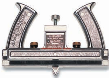
Alligator® 300 Series Cutter for belts up to 1-9/16" (39 mm).