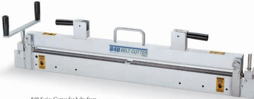
840 Series Cutter for belts from 3/8" (10 mm) to 1" (25 mm).