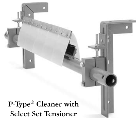
P-Type® Cleaner with Select Set Tensioner

The Select Set™ Tensioner works with Eliminator® P-Type®, I-Type™ and R-Type® secondary cleaners to improve versatility and operating performance. The system allows users to position the adjusting bolts for tensioning the blade tips either below the cleaner pole for push-up tensioning, or above the pole as a pull-up tensioner. Some conveyor structures have space limitations, and some are blocked by obstructions. The versatility of the Select Set Tensioner allows the system to fit the needs of the conveyor, making it an easy-to-use solution for tensioning the cleaner.