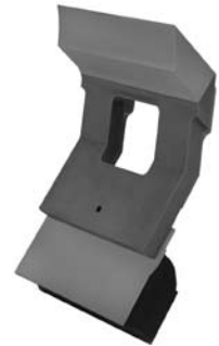
Replacement Blades and Cushions (HXF shown)

Keeping your cleaning systems operating at peak performance is easy with the use of genuine Eliminator® replacement parts. All blades and cushions are made from high quality, long-lasting components to exacting specifications. Flexco has everything to keep your cleaners operating at maximum efficiency. Use genuine Eliminator repair parts to ensure quality, performance and satisfaction. Ask for the Maintenance Made Easy Brochure for detailed replacement parts information.