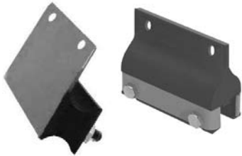
P-Type® and R-Type® Neoprene Cushions