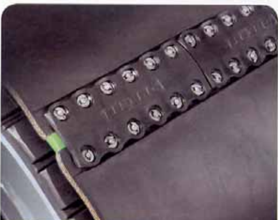
Figure 5. Rubber covered fasteners, such as Flexco® VP fasteners are ideal for use with belt cleaners and highly abrasive materials.

Certainly, fastener selection will influence overall performance. With no two cement plant operations the same, the wide selection of fastener designs can be chosen to correspond with factors including: