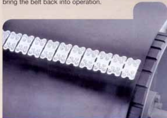
Figure 2. The broad width and heavy gauge of Flexco's BR™ solid plate fasteners provide long fastener wear life and higher tension splices.

those higher tension ratings combines with the speed and simplicity of mechanical fastener installation. As a result, mechanical fasteners have become the choice when fast, dependable and economical belt repairs help companies maintain top productivity. Compared with vulcanisation, mechanical fasteners afford much faster belt splice times, taking just 1 – 2 hours at the most to bring the belt back into operation.