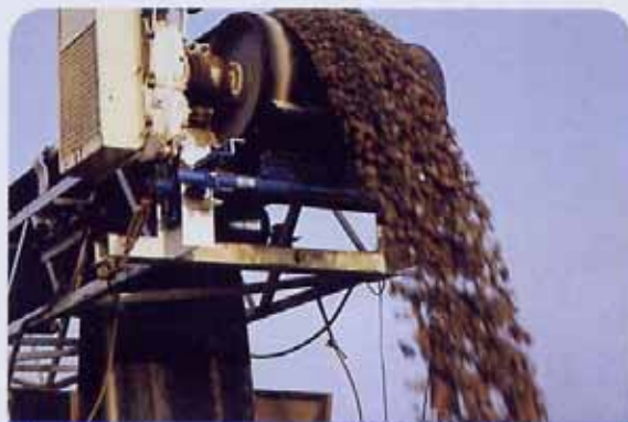
Figure 6. Maximum uptime can be enhanced through proper fastener selections and solutions.