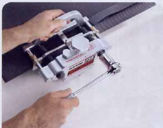
Figure 7. Specially designed skivers quickly, safely and uniformly remove strips of rubber top cover to lower fastener plates below the surface of the belt.

penetrate deep into the belt carcass – without damaging the carcass fibres.