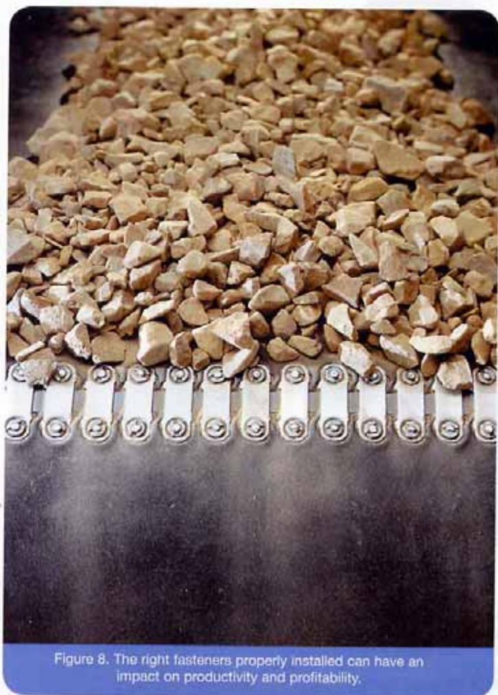
Figure 8. The right fasteners properly installed can have an impact on productivity and profitability.