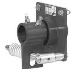
PST Spring Tensioner