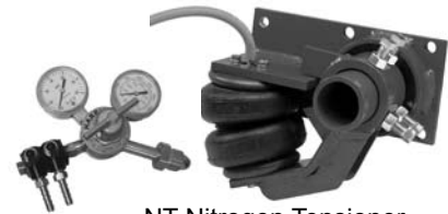
NT Nitrogen Tensioner and Regulator