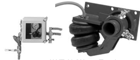
AWT Air/Water Tensioner and Control Box